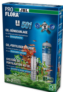
JBL PROFLORA u501 Plant fertiliser system complete kit