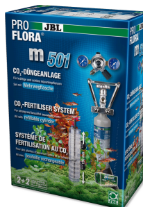
JBL PROFLORA m501 CO 2 plant fertiliser system complete kit