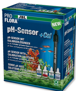
JBL PROFLORA pH-Sensor+Cal

Cleaning and storage solution for pH electrodes