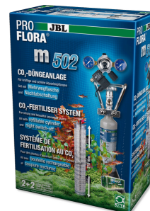
JBL PROFLORA m502 CO 2 plant fertiliser system with night switch-off