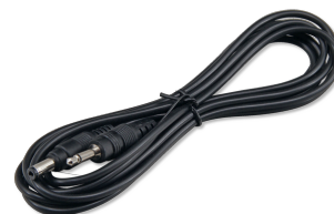
JBL pH Control Touch connection cable