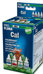
JBL PROFLORA Cal

Special hose for CO2 systems in aquariums