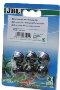
JBL slotted suction cup, 2mm

Holder for heating cables in aquariums and terrariums