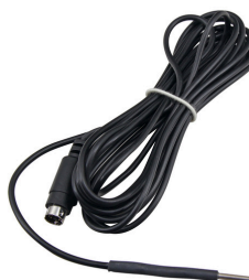
JBL pH Control temperature sensor