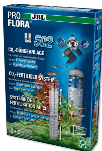
JBL PROFLORA u502 Plant fertiliser system with night switch-off