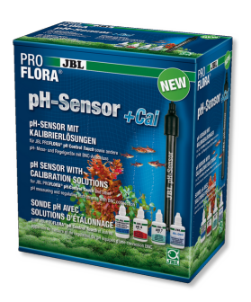
JBL PROFLORA pH-Sensor+Cal