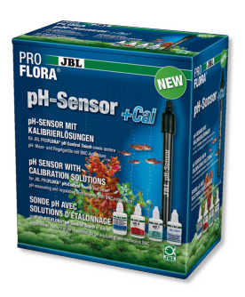
JBL PROFLORA pH-Sensor+Cal