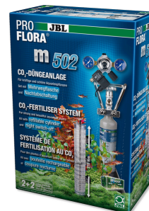
JBL PROFLORA m502 CO 2 plant fertiliser system with night switch-off