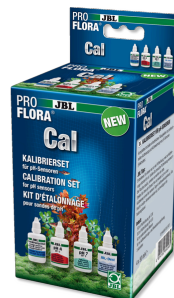
JBL PROFLORA Cal Complete kit for calibration