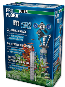
JBL PROFLORA m502 CO 2 plant fertiliser system with night switch-off