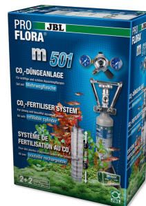
JBL PROFLORA m501 CO 2 plant fertiliser system complete kit