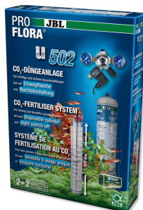
JBL PROFLORA u502 Plant fertiliser system with night switch-off