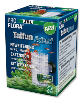
JBL PROFLORA Taifun Extend

Extension for CO2 highperformance diffuser