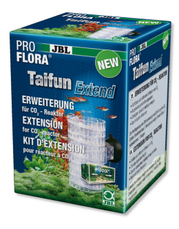
JBL PROFLORA Taifun Extend Extension for CO2 high-performance diffuser