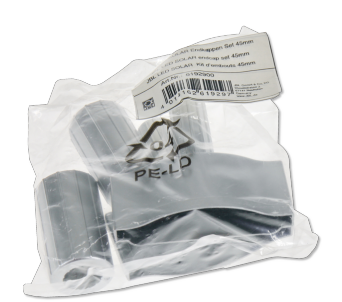
JBL LED SOLAR end cap set