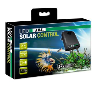
JBL LED SOLAR CONTROL Control unit for JBL LED SOLAR lights