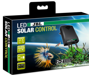
JBL LED SOLAR CONTROL