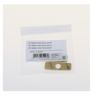
JBL DigiScan Velcro Pad, 2x