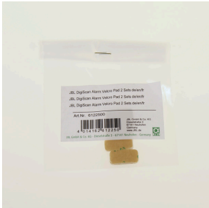
JBL DigiScan Alarm Velcro Pad, 2 sets