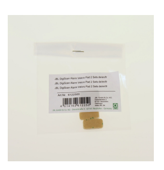
JBL DigiScan Alarm Velcro Pad, 2 sets