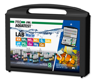
JBL PROAQUATEST LAB Marin

Professional test case for marine water analysis