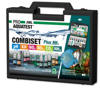
JBL PROAQUATEST COMBISET Plus NH4 Test case with most important water tests + NH4 test