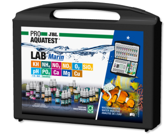
JBL PROAQUATEST LAB Marin Professional test case for marine water analysis