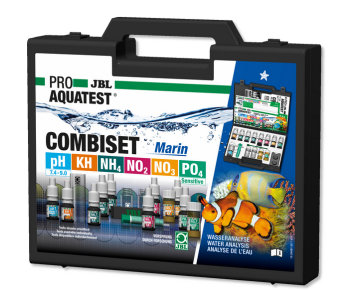
JBL PROAQUATEST COMBISET Marin Test case for water analyses in marine aquariums