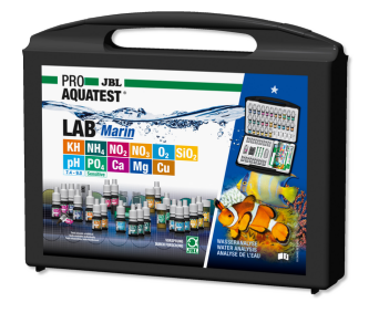
JBL PROAQUATEST LAB Marin

Professional test case for marine water analysis