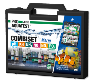
JBL PROAQUATEST COMBISET Marin

Professional test case for marine water analysis