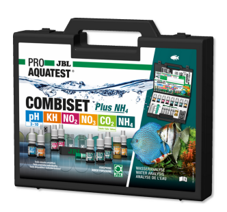
JBL PROAQUATEST COMBISET Plus NH4

Test case with most important water tests + NH4 test