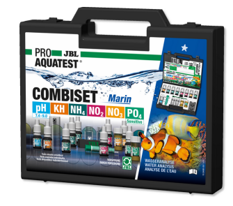
JBL PROAQUATEST COMBISET Marin

Professional test case for marine water analysis