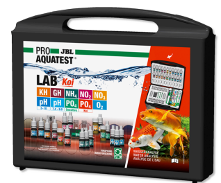
JBL PROAQUATEST LAB Koi Professional test case for koi and garden ponds