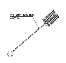
JBL ProTemp e300/500 cleaning brush