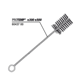
JBL ProTemp e300/500 cleaning brush