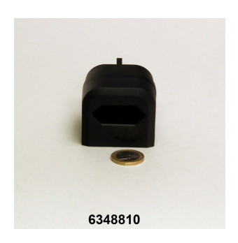
JBL adapter UK for all flat-pin plugs