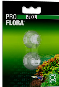
JBL suction cup with clip, 6 mm

Transp. suction cups + clips for objects 6mm approx.