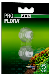
JBL suction cup with clip, 6 mm

Transp. suction cups + clips for objects 6mm approx.