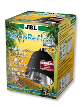
JBL TempReflect light Reflector screen for energysaving lamps