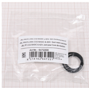
JBL PF CO 2 BIO REAKTOR seal