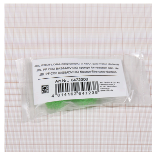
JBL PF CO 2 BIO REAKTOR filter