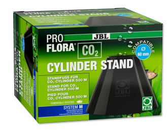
JBL PROFLORA CO2 CYLINDER STAND Stand for 500 g CO2 cylinders