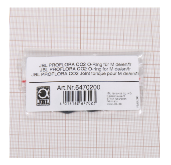
JBL PROFLORA CO2 Oring for m