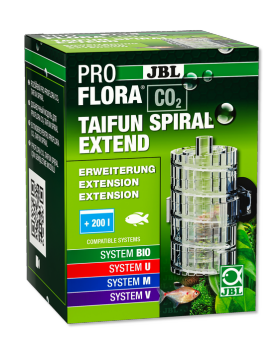
JBL PROFLORA CO2 TAIFUN SPIRAL EXTEND

Expandable CO2 reactor for freshwater aquariums