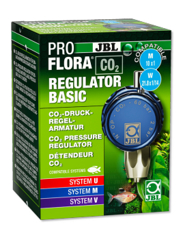
JBL PROFLORA CO2 REGULATOR BASIC

Glass CO2 diffuser for freshwater tanks from 40-300 l