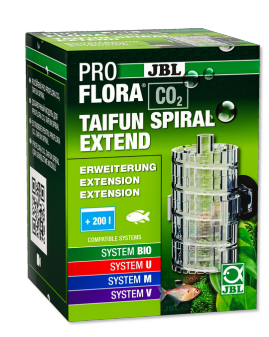
JBL PROFLORA CO2 TAIFUN SPIRAL EXTEND

Expandable CO2 reactor for freshwater aquariums