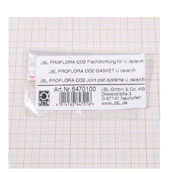
JBL PF CO2 flat gasket for u