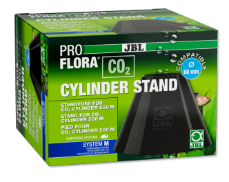
JBL PROFLORA CO2 CYLINDER STAND

Wall mount for CO2 cylinders with safety bracket