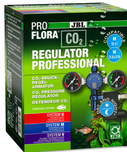
JBL PROFLORA CO2 REGULATOR PROFESSIONAL Pressure regulator with 2 displays & valve for CO2