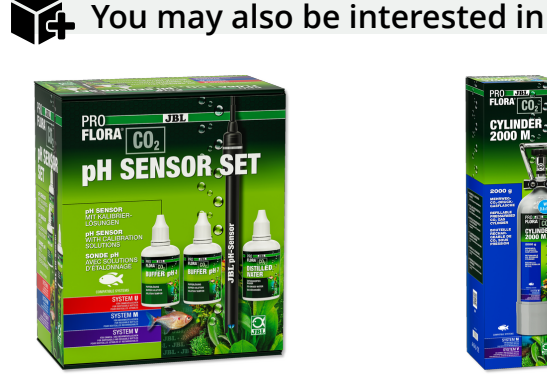
JBL PROFLORA CO2 pH SENSOR SET pH electrode, labor. guality for almost all pH devices