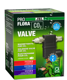
JBL PROFLORA CO2 VALVE CO2 solenoid valve for regulated CO2 addition