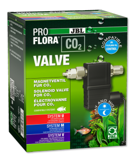
JBL PROFLORA CO2 VALVE

CO2 solenoid valve for regulated CO2 addition