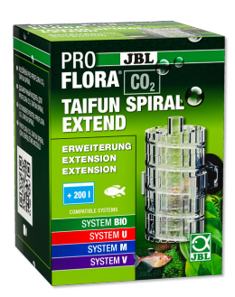
JBL PROFLORA CO2 TAIFUN SPIRAL EXTEND

Glass CO2 diffuser for freshwater tanks from 40-300 l