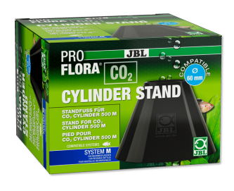
JBL PROFLORA CO2 CYLINDER STAND

pH electrode, labor. quality for almost all pH devices