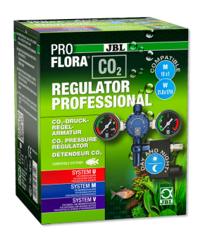
JBL PROFLORA CO2 REGULATOR PROFESSIONAL

CO2 solenoid valve for regulated CO2 addition