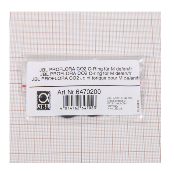
JBL PROFLORA CO2 Oring for m