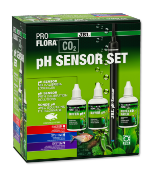
JBL PROFLORA CO2 pH SENSOR SET

CO2 conversion adapter disposable to refillable bottle