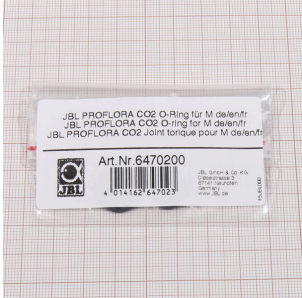
JBL PROFLORA CO2 O- ring for m