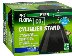
JBL PROFLORA CO2 CYLINDER STAND Stand for 500 g CO2 cylinders