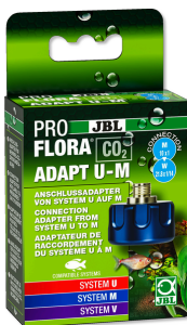
JBL PROFLORA CO2 ADAPT U - M CO2 conversion adapter disposable to refillable bottle