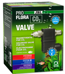
JBL PROFLORA CO2 VALVE CO2 solenoid valve for regulated CO2 addition