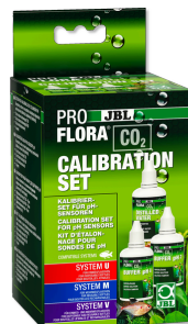
JBL PROFLORA CO2 CALIBRATION SET To calibrate and store pH electrodes