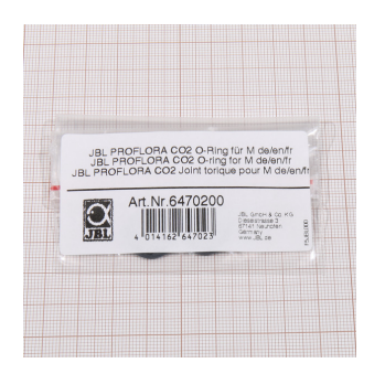
JBL PROFLORA CO2 Oring for m