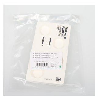
JBL PF CO2 CALIBRATION tray To keep the cuvettes upright during calibration