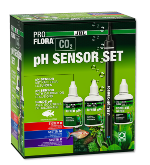
JBL PROFLORA CO2 pH SENSOR SET

pH electrode, labor. quality for almost all pH devices