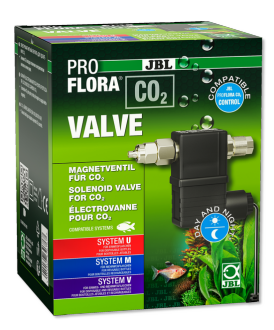
JBL PROFLORA CO2 VALVE

CO2 solenoid valve for regulated CO2 addition