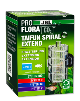
JBL PROFLORA CO2 TAIFUN SPIRAL EXTEND

Expandable CO2 reactor for freshwater aquariums