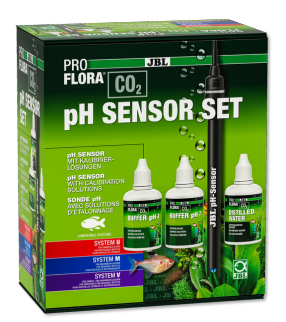
JBL PROFLORA CO2 pH SENSOR SET

pH electrode, labor. quality for almost all pH devices