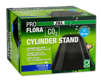
JBL PROFLORA CO2 CYLINDER STAND

Disposable storage bottle ready-filled with 1.2 kg CO2