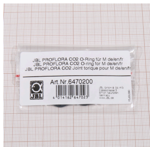
JBL PROFLORA CO2 O- ring for m