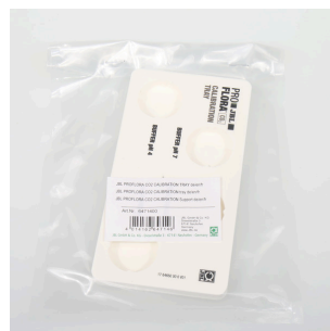
JBL PF CO2 CALIBRATION tray To keep the cuvettes upright during calibration