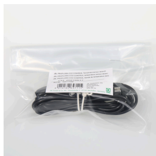
JBL PF CO2 CONTROL temperature sensor