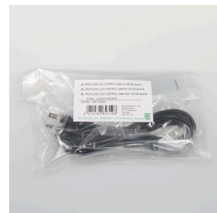
JBL PF CO2 CONTROL cable for VALVE