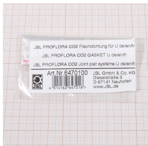
JBL PF CO2 flat gasket for u