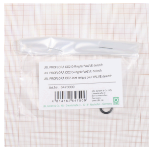
JBL PF CO2 O-ring for VALVE