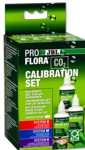
JBL PROFLORA CO2 CALIBRATION SET To calibrate and store pH electrodes