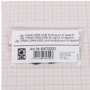
JBL PROFLORA CO2 O- ring for m