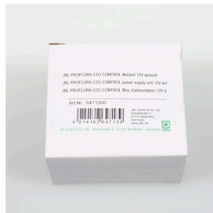
JBL PF CO2 CONTROL power supply unit 12V