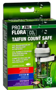
JBL PROFLORA CO2 TAIFUN COUNT SAFE CO2 bubble counter with built-in check valve