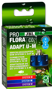
JBL PROFLORA CO2 ADAPT U - M CO2 conversion adapter disposable to refillable bottle