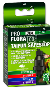
JBL PROFLORA CO2 TAIFUN SAFESTOP Water backflow protection for CO2 systems