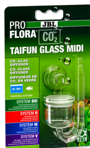
JBL PROFLORA CO2 TAIFUN GLASS Glass CO2 diffuser for freshwater tanks from 40-300 l