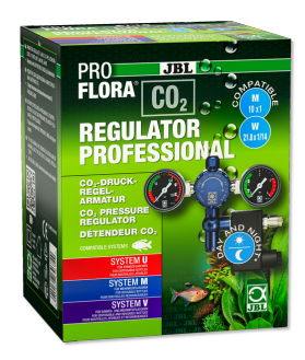
JBL PROFLORA CO2 REGULATOR PROFESSIONAL Pressure regulator with 2 displays & valve for CO2