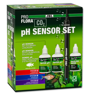
JBL PROFLORA CO2 pH SENSOR SET pH electrode, labor. quality for almost all pH devices