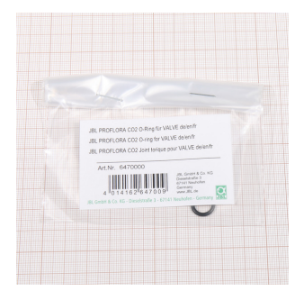
JBL PF CO2 O-ring for VALVE