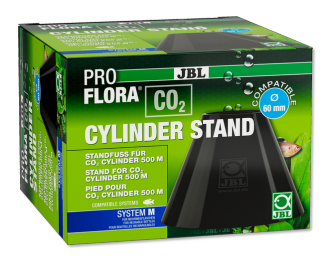
JBL PROFLORA CO2 CYLINDER STAND Stand for 500 g CO2 cylinders