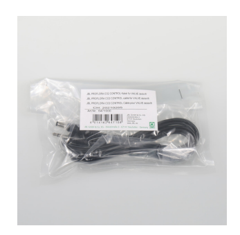
JBL PF CO2 CONTROL cable for VALVE