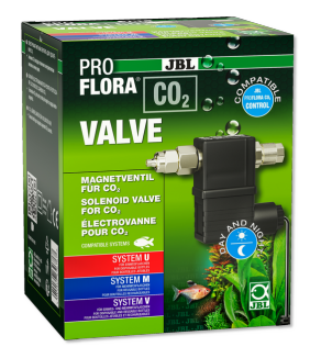
JBL PROFLORA CO2 VALVE CO2 solenoid valve for regulated CO2 addition