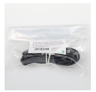
JBL PF CO2 CONTROL temperature sensor