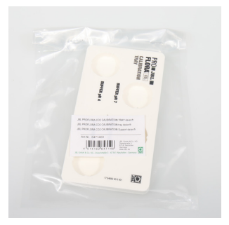
JBL PF CO2 CALIBRATION tray To keep the cuvettes upright during calibration