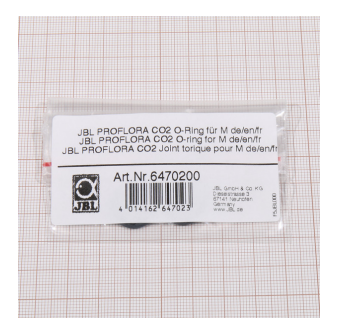
JBL PROFLORA CO2 Oring for m