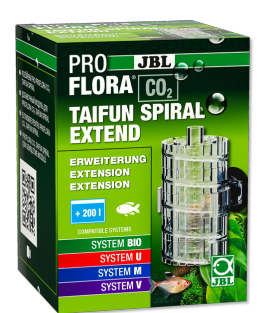
JBL PROFLORA CO2 TAIFUN SPIRAL EXTEND Extension for JBL PROFLORA CO2 TAIFUN SPIRAL 5 / 10