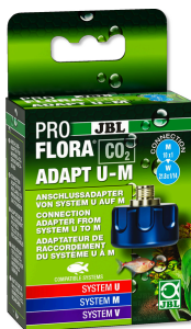
JBL PROFLORA CO2 ADAPT U - M CO2 conversion adapter disposable to refillable bottle