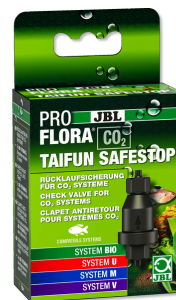
JBL PROFLORA CO2 TAIFUN SAFESTOP Water backflow protection for CO2 systems