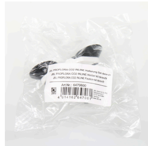
JBL PF CO2 INLINE holder set