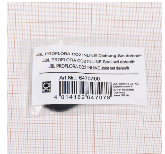
JBL PF CO2 INLINE seal set