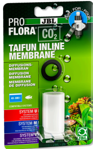
JBL PROFLORA CO2 TAIFUN INLINE MEMBRANE

Replacement diaphragm for CO2 TAIFUN INLINE diffuser