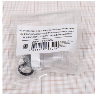
JBL PF CO2 INLINE bubble counter + check valve

Replacement diaphragm for CO2 TAIFUN INLINE diffuser