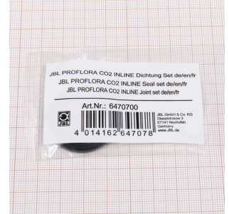
JBL PF CO2 INLINE seal set