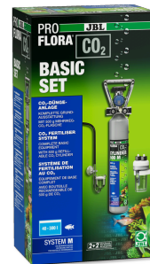
JBL PROFLORA CO 2 BASIC SET M CO 2 fertil. system basic compl. set f. aquarium plants