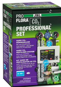
JBL PROFLORA CO 2 PROFESSIONAL SET V CO 2 plant fertiliser system & CO 2 control (NO BOTTLE)