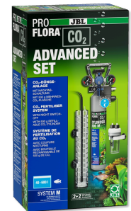
JBL PROFLORA CO 2 ADVANCED SET M CO 2 plant fertilis. system compl. set+night switch-off