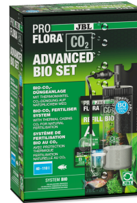
JBL PROFLORA CO 2 ADVANCED BIO SET Bio-CO 2 fertiliser system for freshw. tanks (40-110 l)