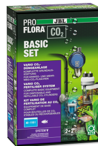
JBL PROFLORA CO 2 BASIC SET V CO 2 fertiliser system (NO BOTTLE!) for aquarium plants