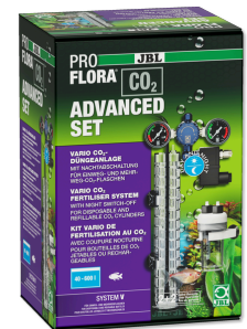
JBL PROFLORA CO 2 ADVANCED SET V CO 2 system (NO BOTTLE!) with gauges & solenoid valve