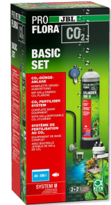
JBL PROFLORA CO 2 BASIC SET U CO 2 fertil. system basic compl. set f. aquarium plants