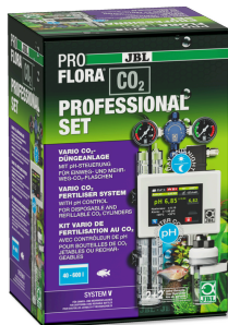
JBL PROFLORA CO2 PROFESSIONAL SET V CO2 plant fertiliser system & CO2 control (NO BOTTLE)