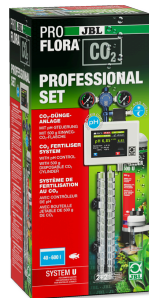
JBL PROFLORA CO2 PROFESSIONAL SET U CO2 plant fertiliser complete set + CO2/pH control