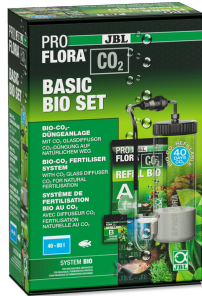
JBL PROFLORA CO2 BASIC BIO SET Bio-CO2 fertiliser system for freshw. tanks (40-80 l)