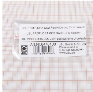
JBL PF CO2 flat gasket for u