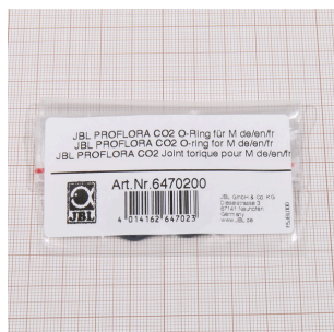
JBL PROFLORA CO2 O- ring for m