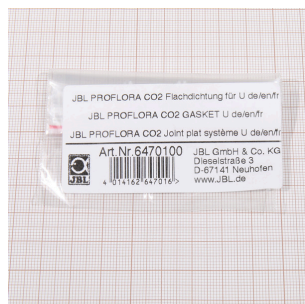
JBL PF CO2 flat gasket for u