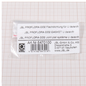
JBL PF CO2 flat gasket for u