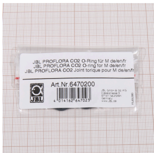
JBL PROFLORA CO2 O- ring for m