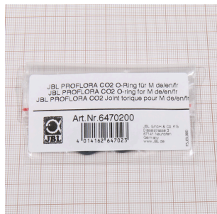
JBL PROFLORA CO2 O- ring for m