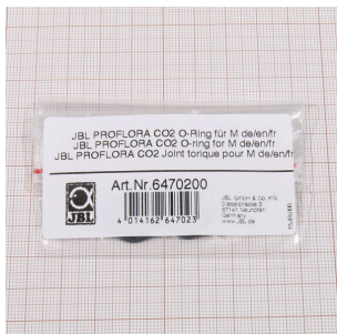
JBL PROFLORA CO2 O- ring for m