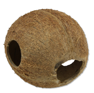
JBL Cocos Cava Coconut cave for aquariums and terrariums