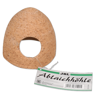
JBL Ceramic spawning cave Ceramic cave for freshwater aquariums