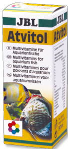
JBL Atvitrol Multivitamin drops for aquarium fish